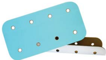
Cardboard Folding Splint, Full Foam