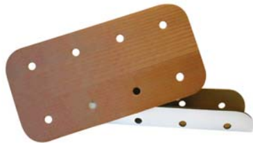
Cardboard Folding Splint, Plain

For use in limb immobilization. Morrison Medical Corrugated Cardboard Folding Splints are available in a variety of sizes and foam options. Splints feature 5/8" holes for tie downs. Corrugated board exterior is white. 24" and 34" lengths offer an extra center crease for firm support of thin limbs. The Locking Leg Splint features sturdy double locking tabs, measures 4.5" x 14" x 34", and stores flat. Foam options provide increased patient comfort and include center foam, 3-piece foam, full foam, or without foam (plain). Foam measure 3/8" thick. FDA registered.