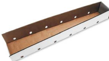
Cardboard Folding Locking Leg Splint, Plain