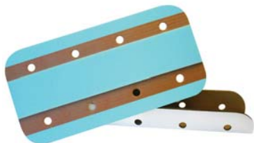
Cardboard Folding Splint, 3-Piece Foam