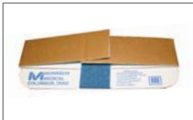
Folds flat for compact storage. Assembles easily for quick use.